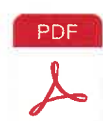
Cover letter & PY2022 PIT Survey for 2.24.22.pdf