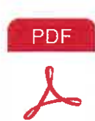
Equal Access Training

Review the documents below to get updated policies, notices, plans and more related to the execution of the St. Clair County Continuum of Care.