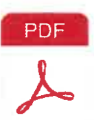
Instructions for PY2022 PIT Survey Document