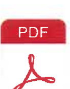
Education Policy -St. Clair County IL 508 COC.pdf