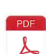
DV HUD Model Emergency Transfer Plan.pdf