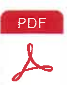
IL508 RFP - CE Eval